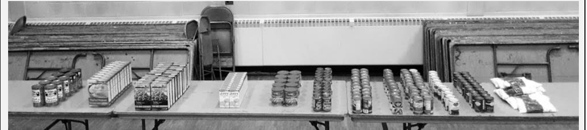
(Some of the Thanksgiving Basket supplies you have sponsored)

The Church School will assemble the baskets today, then the baskets will be available at the rectory for families in need.