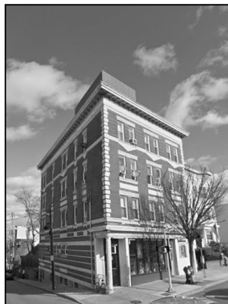
Casa Juan Diego - 97 Yonkers Ave., Ground Floor