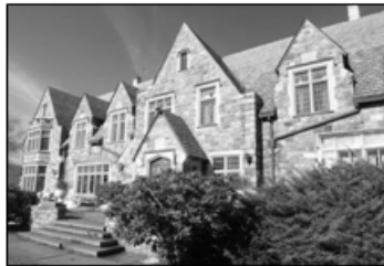
Saint Basil's Academy

REGISTRATION DEADLINE: Nov. 3, 2014 Registration Forms are Available from Your Priest