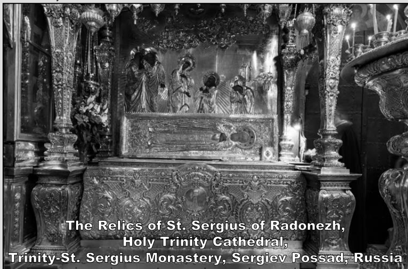
The Relics of St. Sergius of Radonezh, Holy Trinity Cathedral, Trinity-St. Sergius Monastery, Sergiev Possad, Russia

Amidst a large crowd of the devout and the clergy, in the presence of Prince Yurii, the son of Prince Dimitry Donskoi who with the blessing of St. Sergius had routed the Tatars at the Battle of Kulikovo in 1380, the holy relics were removed from the ground and placed temporarily in the wooden Trinity church (at this spot now stands the church of the Descent of the Holy Spirit). With the consecration of the stone Trinity cathedral in 1426, the relics were transferred into it, where they reside today.