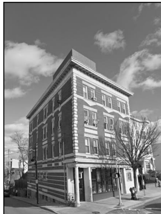
Casa Juan Diego – 97 Yonkers Ave., Ground Floor