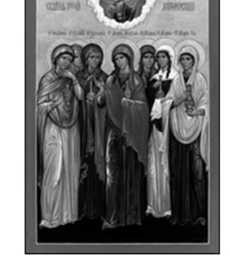
The Holy Myrrh Bearing Women

WHEN: Friday-Sunday, November 14-16, 2014 WHERE: St. Basil's Academy, 79 Saint Basil Road, Garrison, NY COST: There is no charge for this Diocesan sponsored event.